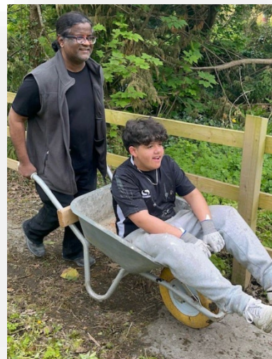
Church garden clearance workday – in prep for a team from Northern Ireland hoping to landscape mid-May. Pray building snags and repairs would be completed by the end of June and the admin by August.